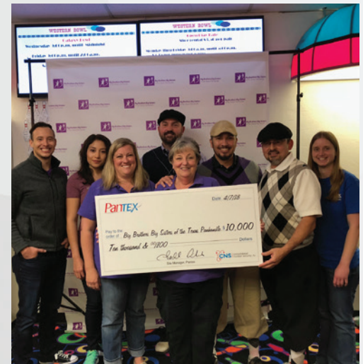
Pantexans raised thousands for Big Brothers Big Sisters in 2018.

Bowl for Kids' Sake is one of Big Brothers Big Sisters' largest annual fundraisers, which accounts for more than 40 percent of the agency's yearly budget. CNS is proud to support Big Brothers Big Sisters' mission to provide all children facing adversity with strong and enduring, professionally supported one-to-one relationships that change lives for the better. Each year, dozens of Pantex workers create teams of bowlers to raise money for BBBS.