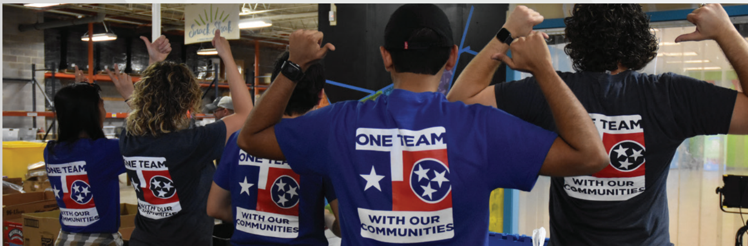
Pantex summer interns proudly display their ONE TEAM t-shirts.