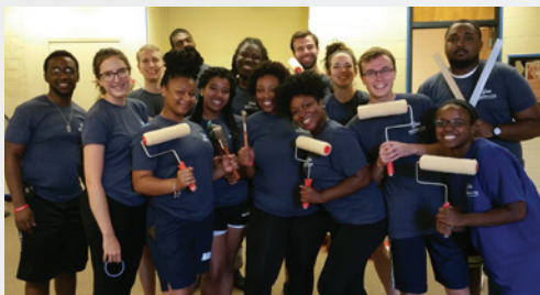
Y-12 summer interns are ready to paint a conference room at the United Way of Anderson County.