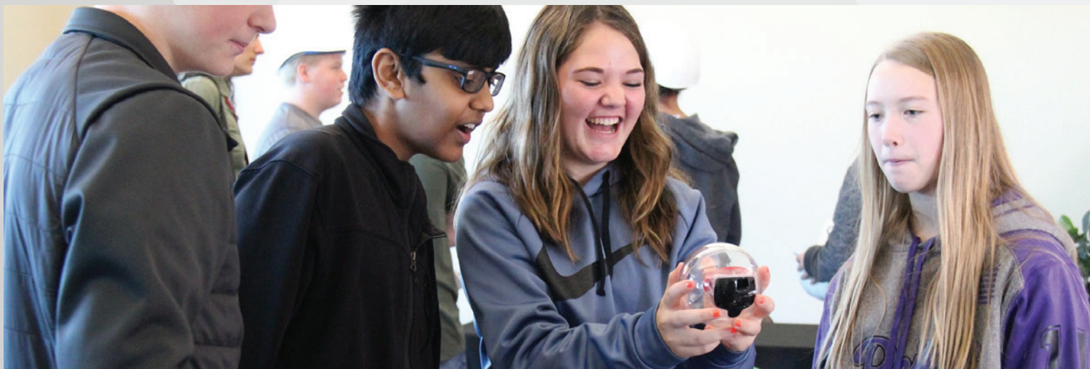
Students interact with industry displays at the Dream it. Do it. kickoff at Oak Ridge Associated Universities' Pollard Auditorium.