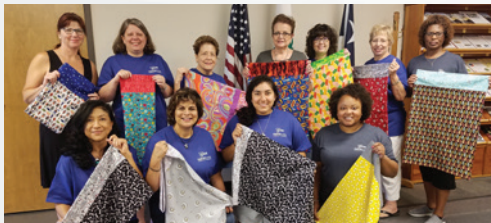
A group of crafty Pantexans and friends joined the Million Pillowcase Challenge and sewed more than 40 pillowcases during the CNS Day of Volunteering. The group donated the colorful new bedding to the Amarillo Downtown Women's Center and Ronald McDonald House.