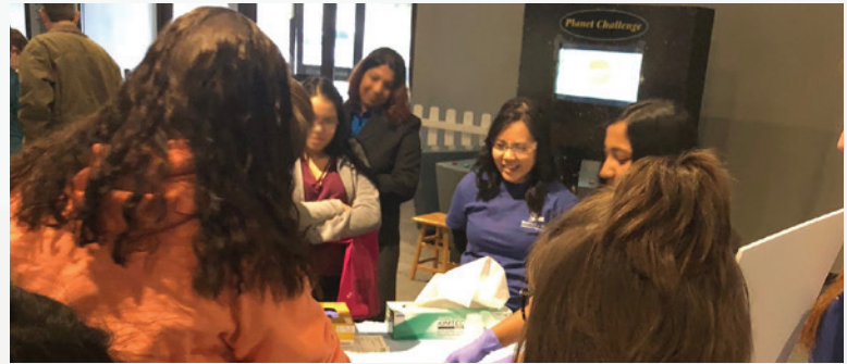
Pantex hosted hundreds of young girls at its first annual Introduce a Girl to Engineering Day.