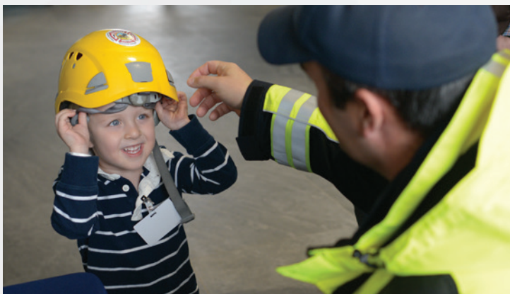
A Pantex firefighter helps a youngster gear up at the John C. Drummond Center Open House.