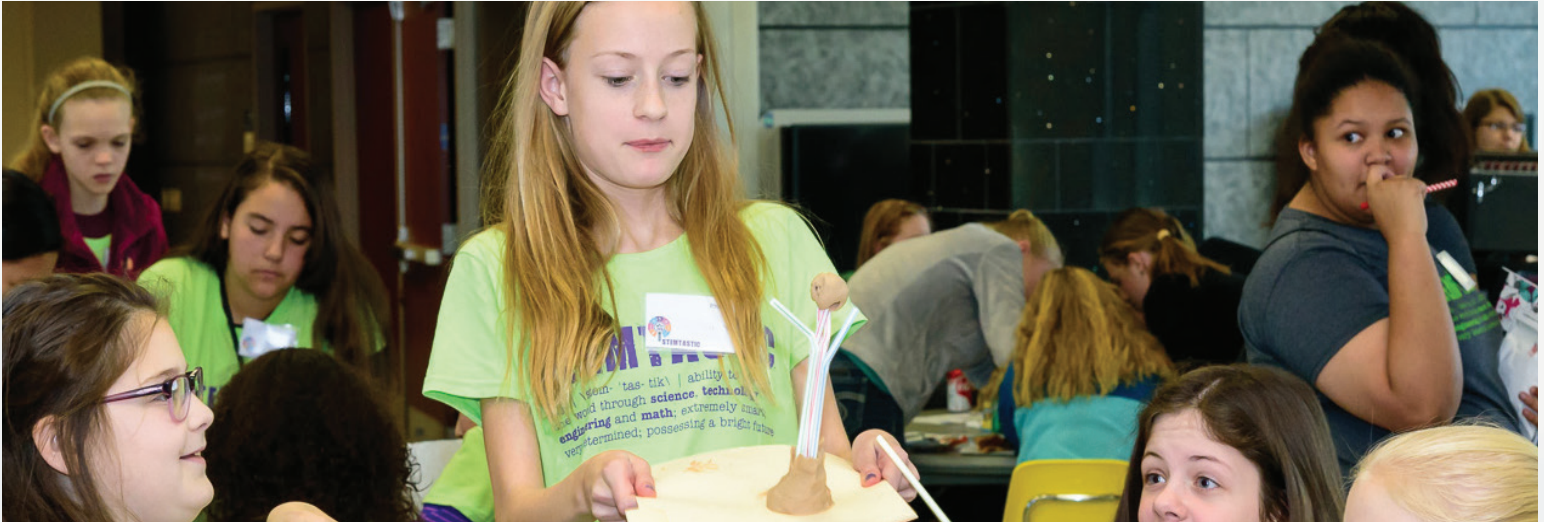
A wise experiment, one of the creations at the annual WISE Experience.

Whether they take Barbie on a bungee jumping adventure to learn about physics, or they are a doctor for a day in the medical session, the girls who attend the event are always enthusiastic about science after their Women in Science Endeavors experience. The annual conference for middle school girls is sponsored by CNS Pantex.