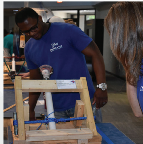
Pantex volunteers helps student hone their skills in the Catapult Competition.