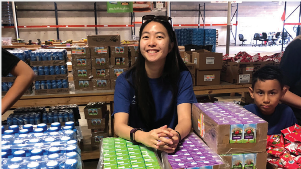
Pantex summer interns helping out at Snack Pak 4 Kids on Day of Volunteering.

CNS purchased mulch, paint, plywood, sewing materials, cloth, and shrubbery for 34 projects in Amarillo and Oak Ridge.