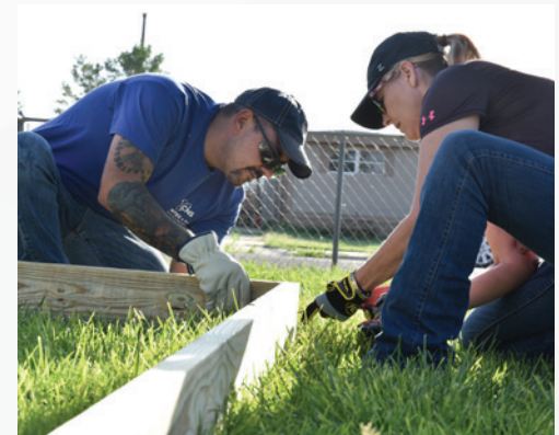
Pantex volunteers build ramps as part of the Texas Ramp project, which aids access to the homes.