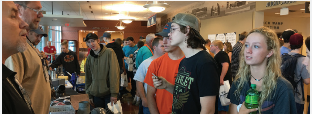
Y-12 hosts Morgan County Vocational students at Manufacturing Awareness Day.

Through collaborations with our trade unions, CNS encourages students to consider careers in trades and crafts in addition to engineering and other technical fields. In October, CNS hosted an inaugural Manufacturing Day, where more than 150 Morgan County Vocational students came to meet Chief Stewards from trades and craft labor.