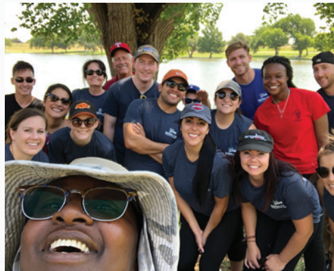
Pantex POLO Club members take time out for a selfie while helping clean up area parks.