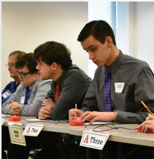
Texas Panhandle students take on Science Bowl challenge.

The Tennessee Science Bowl is the largest Department of Energy high school regional science bowl in the nation. Y-12 supports the event with volunteers who moderate panels and provide assistance where needed. CNS corporate contributions helped 59 teams of students and coaches compete in 2018.