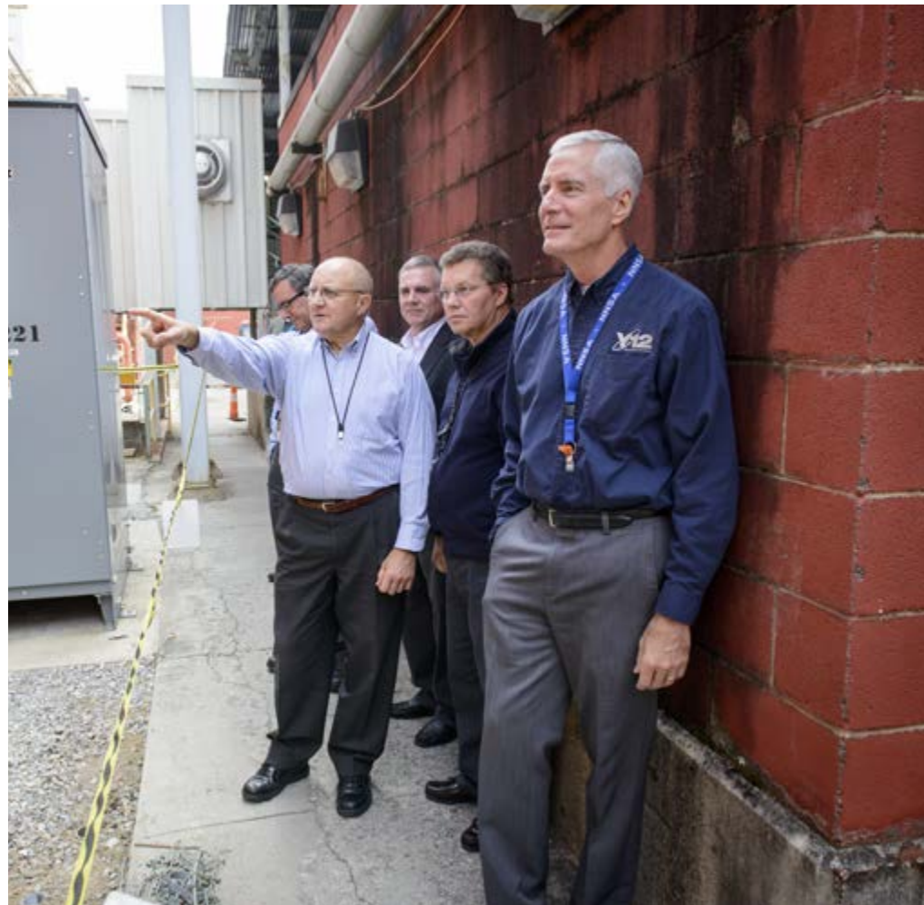
The Y-12 team shows NNSA Uranium Program Manager Tim Driscoll, front, infrastructure upgrades during a tour of Building 9995.

Y-12 also is working to revitalize the infrastructure in other ways, including completing $10 million in upgrades to the analytical chemistry facility to improve mission capability and reliability. Upgrades included improvements to critical heating, ventilation and air condition systems; electrical system upgrades; and replacement of obsolete radiochemistry hoods. These improvements have greatly upgraded Building 9995's work environment by reducing risk to operations and enabling the facility to continue to meet the extensive analytical chemistry needs for Y-12. The year-long effort was completed on schedule and within budget.