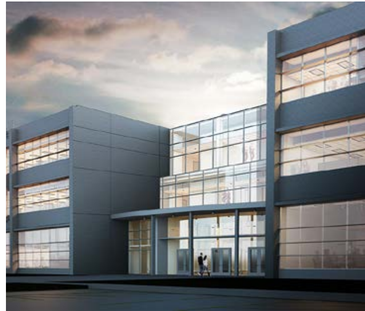
Construction of the new Pantex Administrative Support Complex (rendering above) is slated to begin in August.